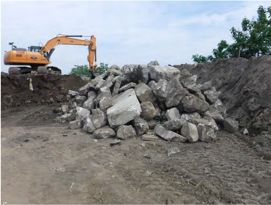
Photograph 7 - June 23, 2017: Final pile of bulky debris to be placed on polyethylene prior to sampling.