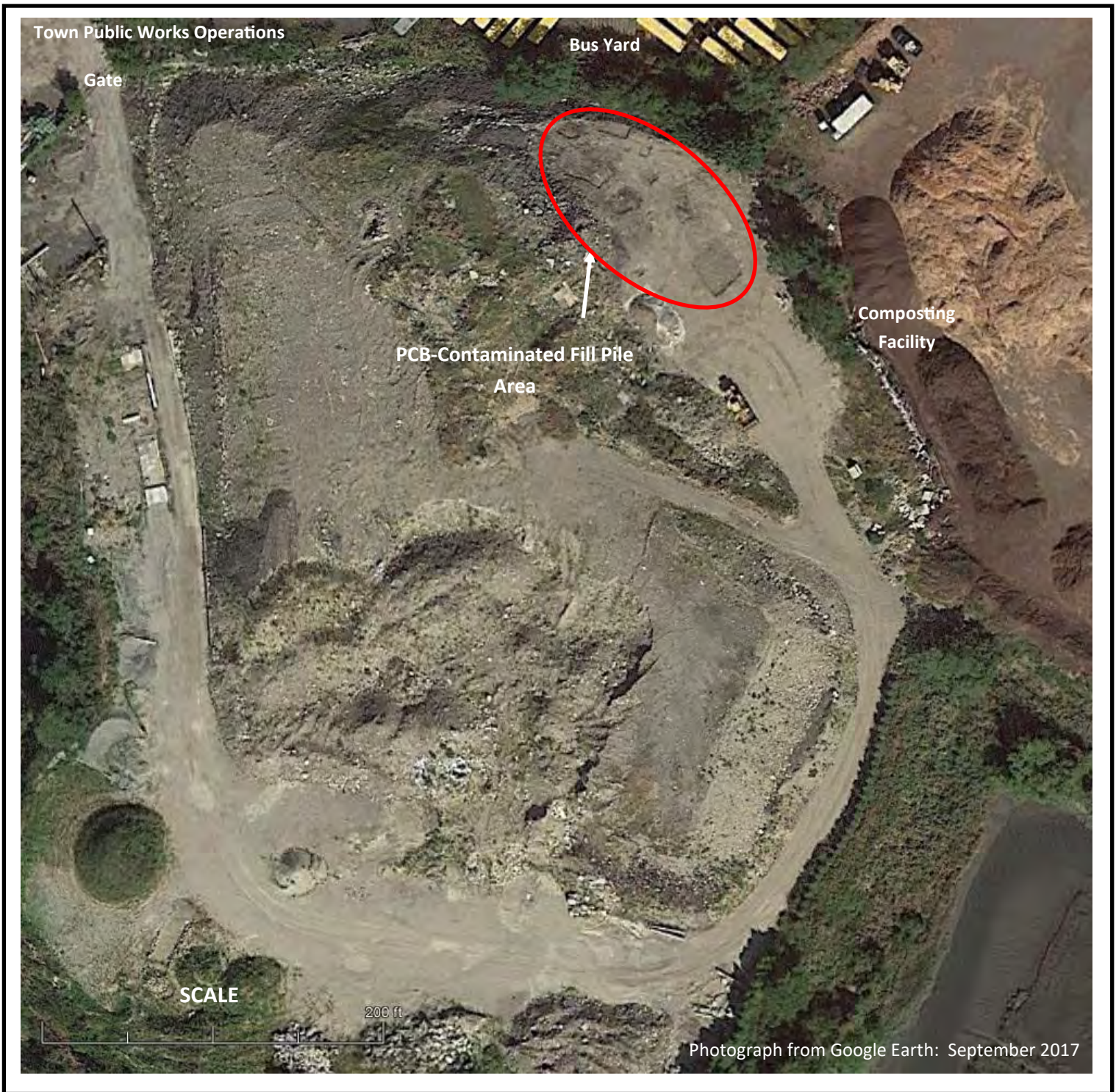
FIGURE 2 - SITE PLAN Town of Fairfield - Reclamation Yard 183 Richard White Way Fairfield, Connecticut