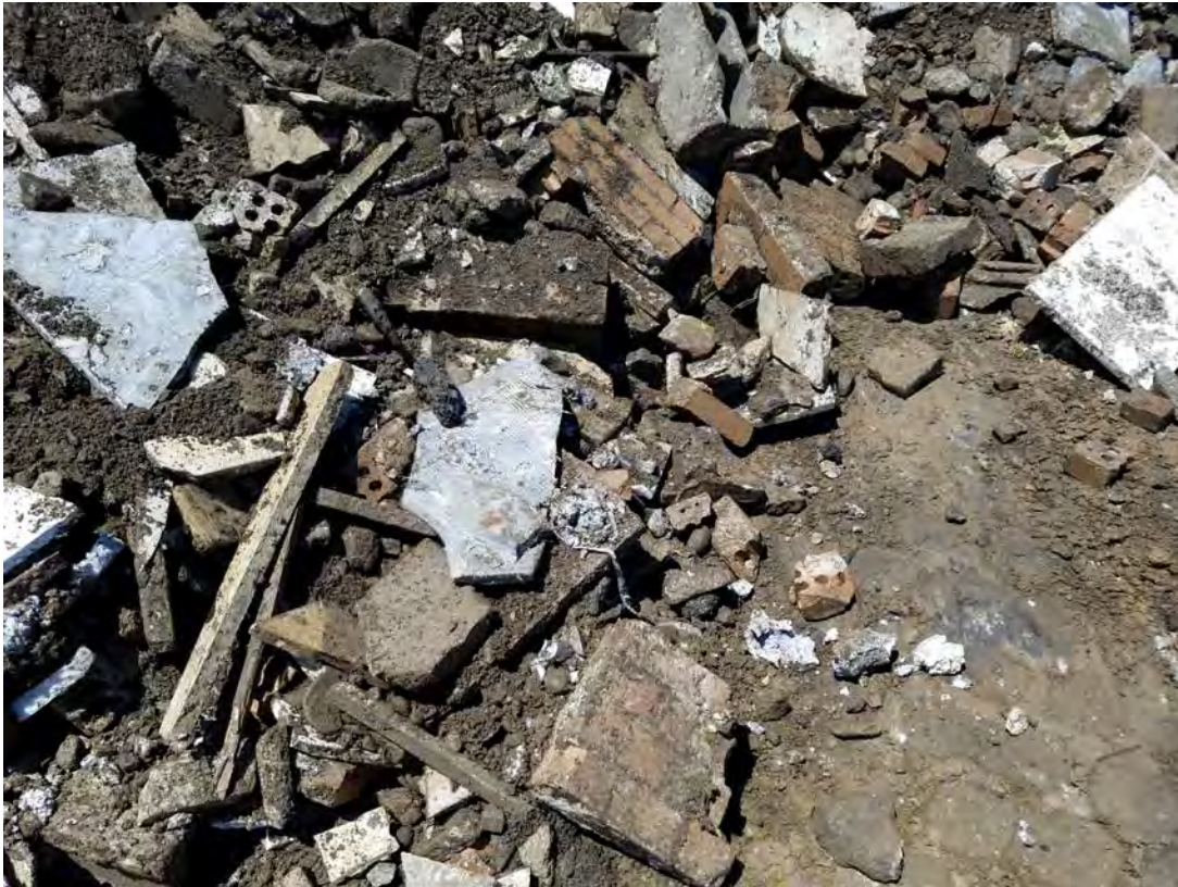
Photograph 5 - June 23, 2017: Fill material present in PCB-contaminated area.