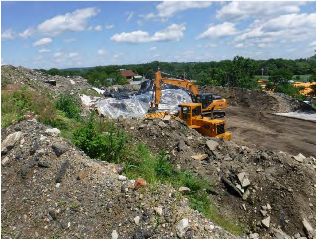
Photograph 1 - June 16, 2017: PCB-contaminated fill pile area covered by polyethylene sheeting.