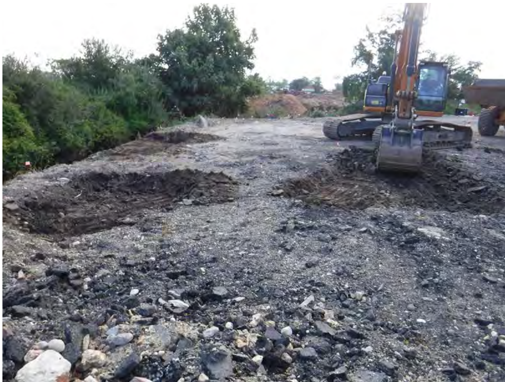
Photograph 18 – September 19, 2017: “Hot-spot” remediation of bottom sample areas that contained PCBs greater than 1 mg/kg.