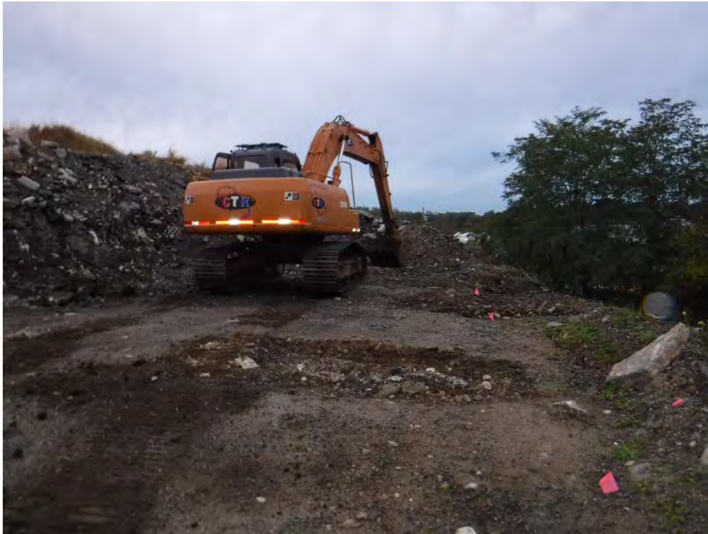
Photograph 19 – October 11, 2017: Final “hot-spot” remediation of bottom sample areas that contained PCBs greater than 1 mg/kg.