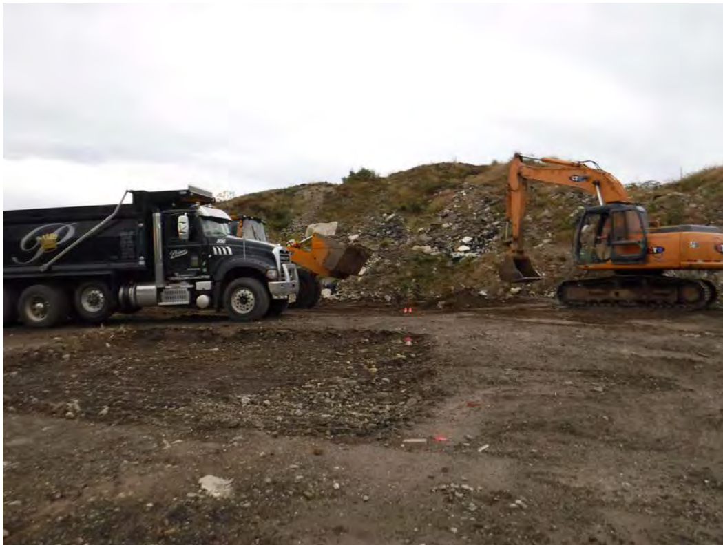
Photograph 20 – October 11, 2017: Final truck being loaded with PCB contaminated soil for offsite disposal.