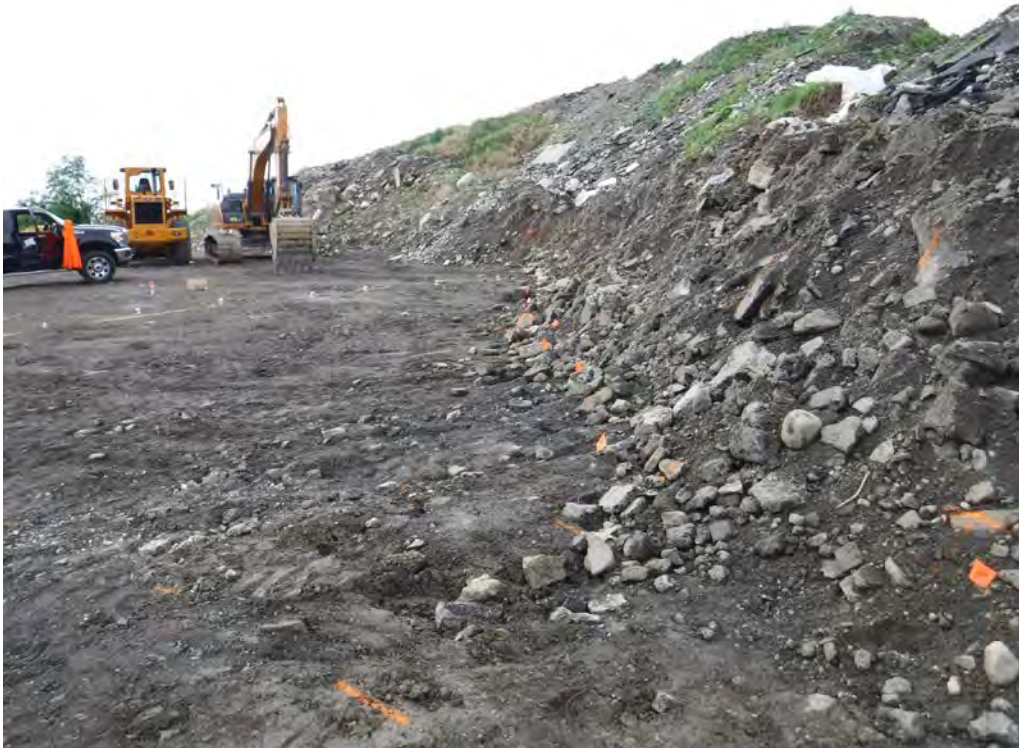
Photograph 12 - June 27, 2017: Sampling grid set up for western sidewall and bottom.