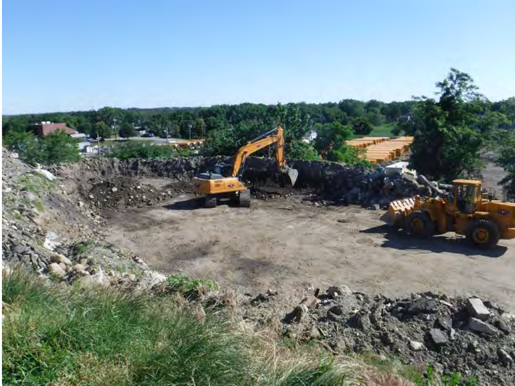
Photograph 10 – June 26, 2017: Excavating soil from the eastern sidewall and bottom of the PCB-contaminated area.