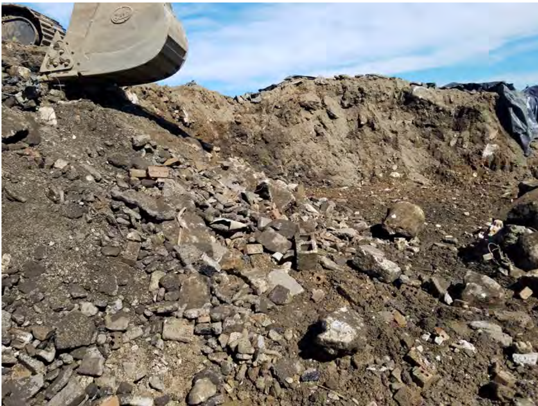
Photograph 4 - June 22, 2017: Type of fill material present in PCB-contaminated area.