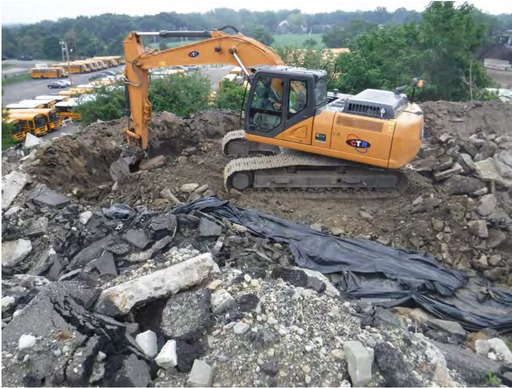
Photograph 9 - June 23, 2017: Excavating soil from the north sidewall (to left) and bottom of the PCB-contaminated area.