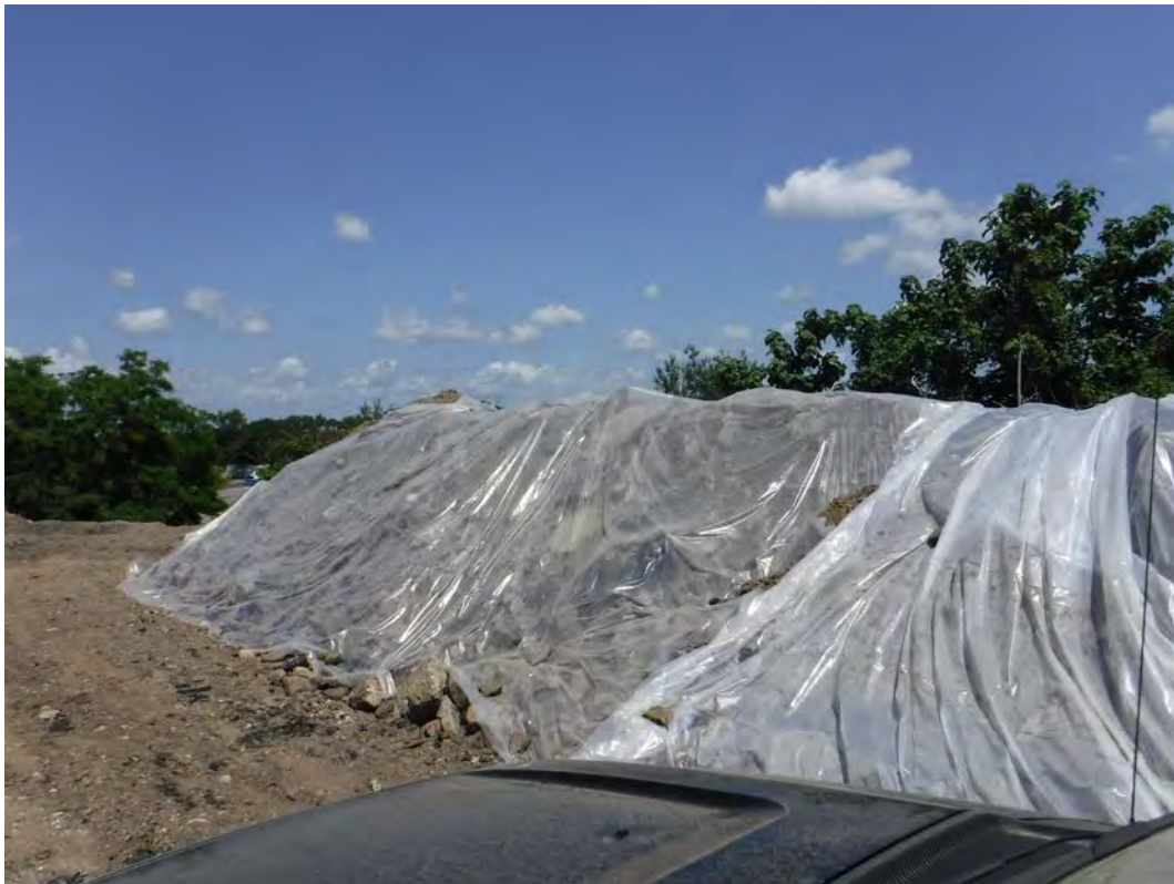
Photograph 14 – July 18, 2017: Soil from the eastern sidewall covered by poly and ready to be loaded for offsite disposal.