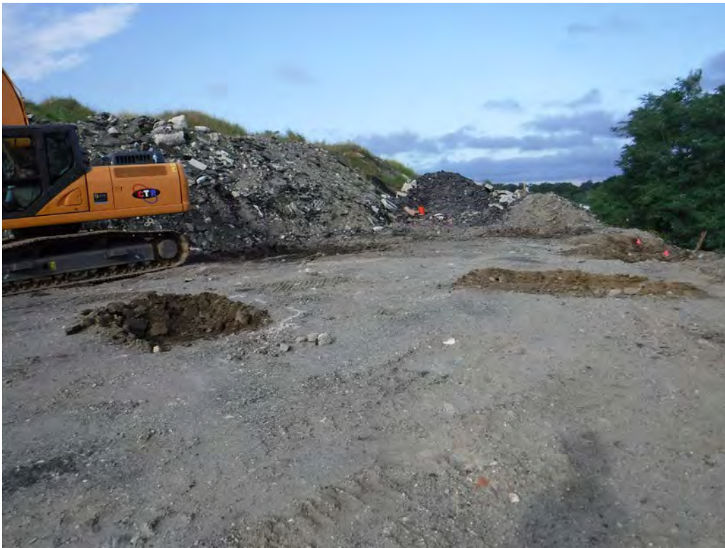
Photograph 17 – September 19, 2017: “Hot-spot” remediation of bottom sample areas that contained PCBs greater than 1 mg/kg.