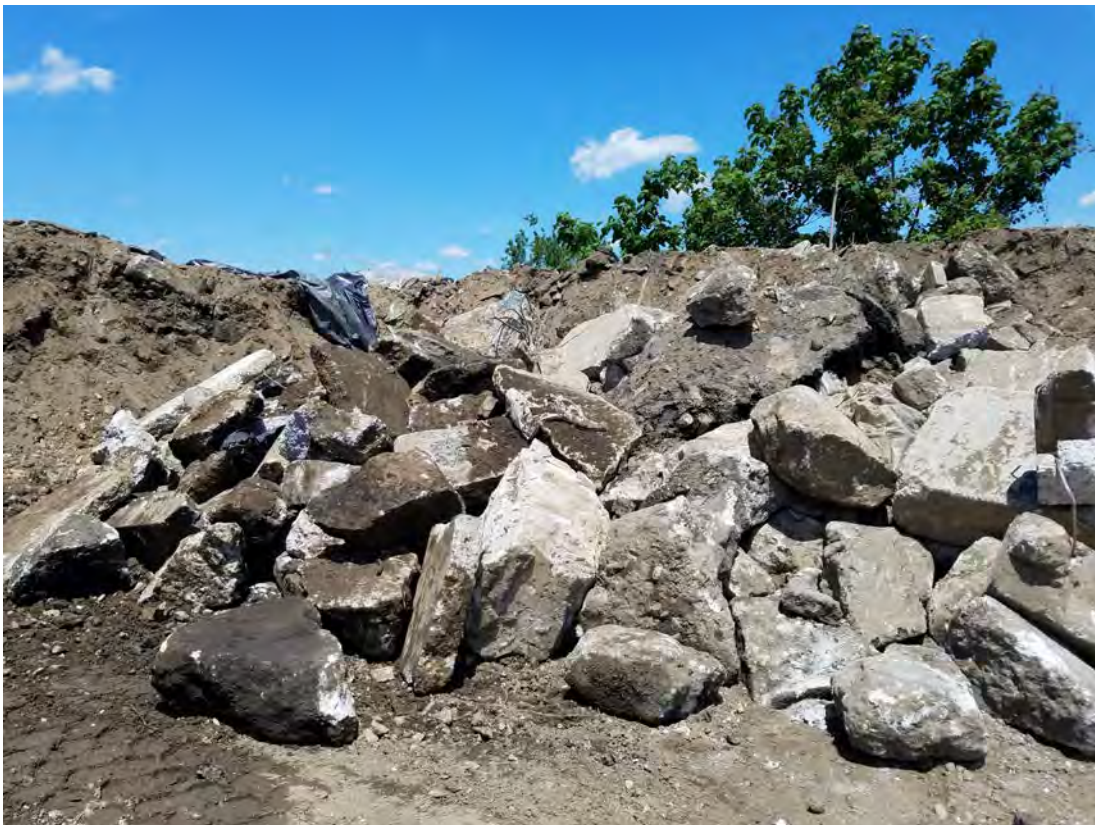
Photograph 6 - June 22, 2017: Additional bulky debris segregated from pile area.