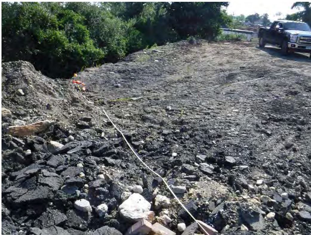
Photograph 16 – August 16, 2017: Laying out the grid for the additional confirmation soil sampling of the pile bottom.