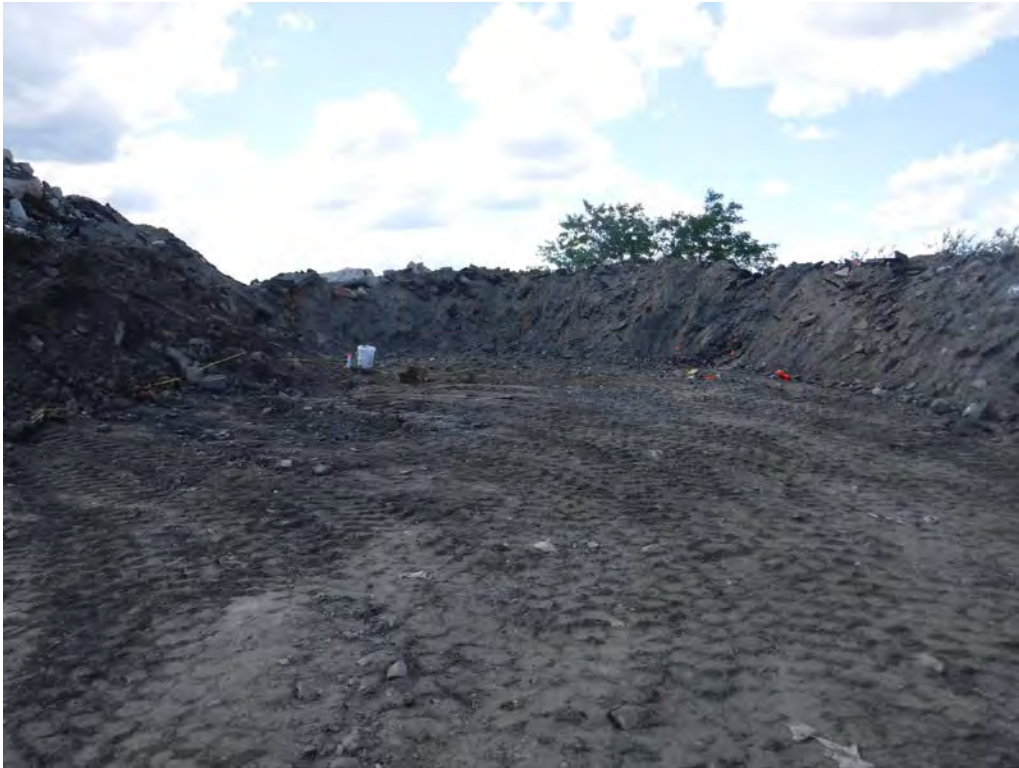
Photograph 11 - June 26, 2017: Initial 1.5-meter sampling grid being set up for western (left), northern (center), and eastern (right) sidewalls and bottom.