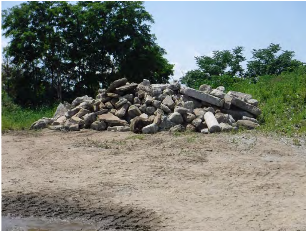
Photograph 15 – July 18, 2017: Pile of the bulky debris that tested ND for PCBs and was moved to the southwest region of the Reclamation Yard.