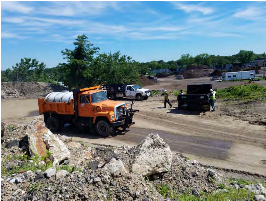
Photograph 3 - June 22, 2017: Dust control measures undertaken by Town using water truck.