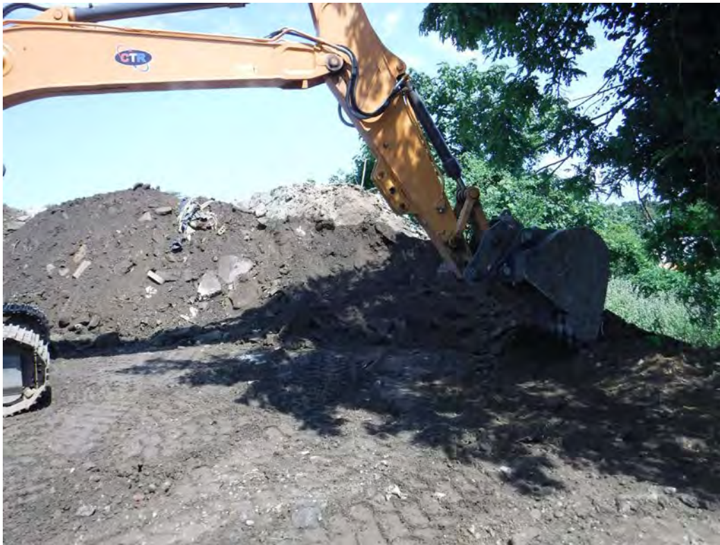
Photograph 13 – July 18, 2017: Start of the excavation of the entire eastern sidewall of the pile area for subsequent offsite disposal.