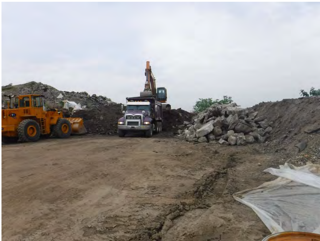
Photograph 8 - June 23, 2017: Triaxle truck being loaded for transport of soil to Hazelton Creek disposal facility.