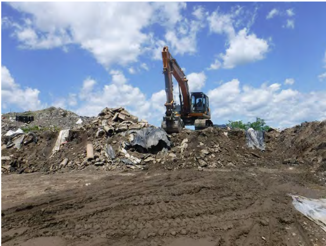
Photograph 2 - June 20, 2017: Segregating the bulky debris from the soil. Debris was placed on polyethylene sheeting (lower right) prior to sampling by LES.